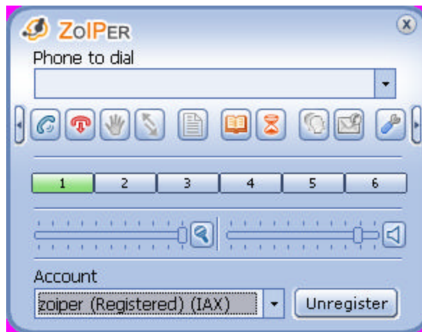
Figure 1: Zoiper

Once downloaded, run the Zoiper installer to install Zoiper. Agree to the license and keep all the default settings. Once installed, click ... Start => All Programs => Attractel => Zoiper Free to start the program. You'll see the following Zoiper screen once started: