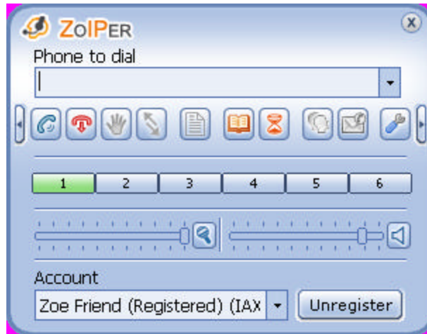
Figure 4: Example Zoiper Registered User